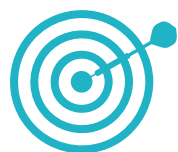
Focusing on your goals

Your approach to investment will vary depending on what you are looking to achieve.